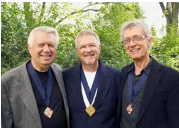
The Mercey Brothers... induction into the Canadian Country Music Hall of Fame.